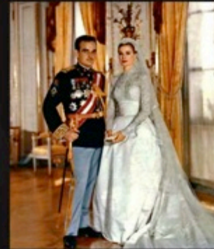
Prince of Monaco