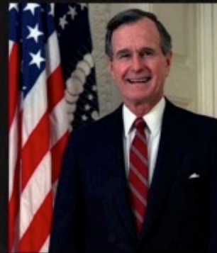
President George W. H. Bush