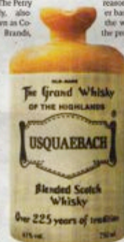
The Brand features three incarnations, each having a different price point and consumer palate.

purchased Usqueabach in 2009. Thanks to the hard work of its current owners and the reliance on a fiercely dedicated customer base longing for its return, the brand can now be found in over 20 states and in all major US markets.