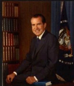
President Richard Nixon